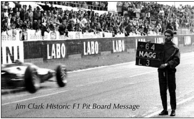
Jim Clark Historic F1 Pit Board Message

DAS, they were not really light weight, so there was always a tradeoff for the data desired vs weight.