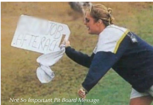
Not So Important Pit Board Message

In early racing, there was no information transmitted from the vehicle or driver while on the track. There were attempts at two-way