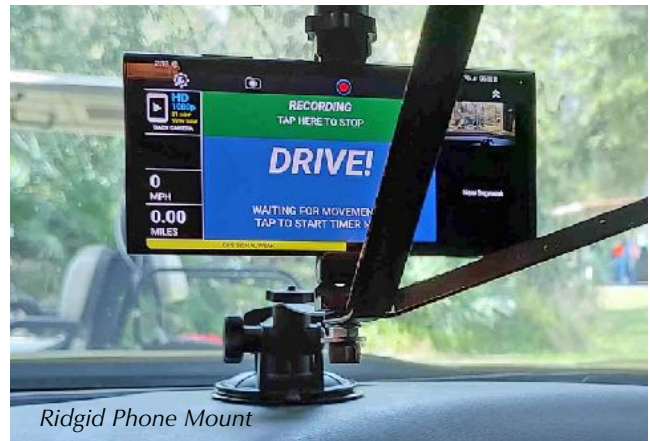
Rigid Phone Mount

To get around the cell phone's slow GPS most of these apps will also allow you to obtain much more accurate and higher refresh rate GPS data with an external GPS unit mounted on your car. These units, such as Haze Engineering's GPS_BT – 18 Hz External GPS can significantly increase your track location accuracy. This unit will provide a much better GPS location data source than your phone via BT. But as you can guess, the more data you want with faster sampling rate the more it costs. It is easy to get several hundred dollars in a system based on your cell phone.